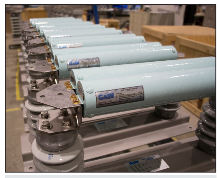
▲ G&W's High Current Limiters.

This is a back-up class of fuse that is meant to clear only the more extreme fault levels. It has a minimum clearing current of 100A (200A for 50A version) when tested per ANSI/IEEE C37.41. It is therefore intended to be used in conjunction with a lower rated (and less costly) device, which will clear the lower fault levels. A pole mounted cutout or expulsion-type power fuse is a typical device.