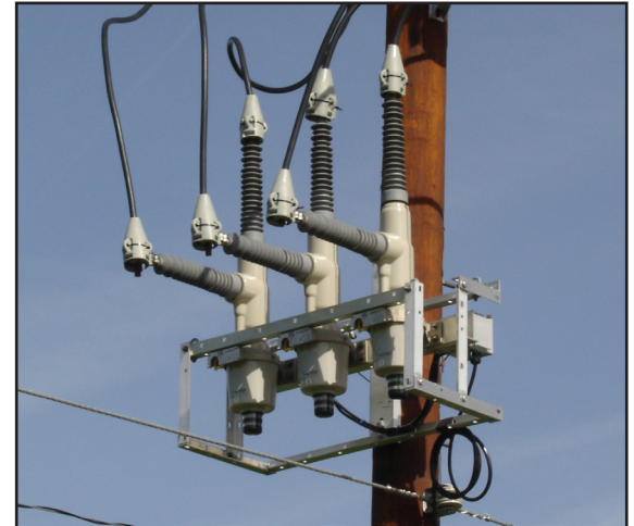
Viper-ST recloser with SEL 651R control.

Five reclosers were placed at specific points in the loop to protect particularly troubled sections. Four of the Viper-ST's were configured as normally closed while the fifth was configured as a normally open point (see Figure 1). Along with the internal voltage sensing of the Viper-ST, all had potential transformers on each side of the recloser to detect loss of voltage and to provide power to the recloser if one of the lines was isolated. Radios communicating DNP protocol were used to link each recloser with the 3351 central processor at the substation.