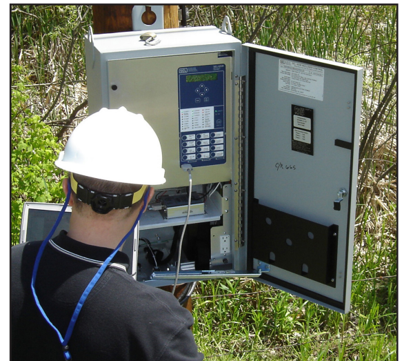
SEL 651R control.